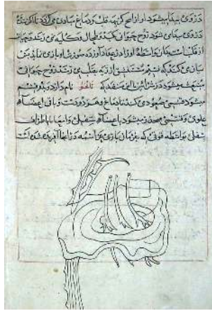
Figure 4: The illustration at the end of the third section of the second chapter [The third section.

is one of the friends of the lung and functions as nearly as the lung does” 55 . “The diaphragm prevents arriving of thick vapors and disgusting extraction from the intestine to the heart. Our [Persian] physicians call these two organs, i.e. the lungs and the diaphragm, as the preparatory servants (خادم مهیی / khādīm-i muhayyī )” 56 . “There is a passage in the diaphragm named as tānjū/tānjū (ثَانُجُو/ثَنْ جُو) [三焦 ( sānjiāo )] that is the pathway through which yim (يَم) [陰 ( yīn )] and the vital spirit (رُوح حيواني / rūh-i ḥayawānī ) flow from the heart to the lower viscera. Whenever there is an obstruction in this way, the animal spirit cannot pass towards the lower viscera, and the damage emerges. Whenever tānjū weakens, it cannot block the disgusting extraction reaching the heart, and the damage occurs. Whenever this pathway is in its own rule, the temperament of a person becomes the best of his own. According to Cathay physicians, the reflective faculty (قَوّه مُتفَكِّرِه) / quwwa-i mutafakkira ) is in this tānjū , and other ones originate from it. The cheerfulness belongs to it (Figure 4)” 57 .