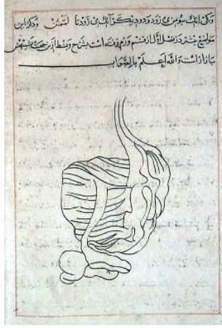
Figure 5: The illustration at the end of the fourth section of the second chapter [The fourth section. On the dissection of bī 76 wī 77 bāw yī 78 tū 79,80 i.e., the statement of the stomach and spleen and the passages in their membranes (فصل چهارم در تشريح بی وی باوشی ثو یعنی شرح معده و طحال) (و بیان منافذ که در غشاء ایشان است) of Tānksūqnāme-i Īlkhān Der Funūn-i ‘Ulūm-i Khaṭā’ī (Courtesy of Türkiye Yazma Eserler Kurumu Başkanlığı, İstanbul, Türkiye).

mun (لُومُن) ” 74 . “Food reaches the cardia from the spleen and unites with the lung from the cardia. Whenever hot weather comes into the lungs, through it, the heat of the heart increases, and the cold is absorbed from the spleen with the command of the True, may He be exalted and be accounted holy (حَقُّ تَعَالَى وَ تَقَدَّسَ) /Haqq ta’ālā wa taqaddasa), and it comes to the lungs. That cold reduces the heat so that the heart does not get harm. Appetite/desire for food appears through the other vessel joining to the pylorus from the spleen (Figure 5)” 75 .