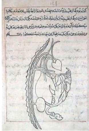
Figure 3: The illustration at the end of the second section of the second chapter [The second section of the second chapter: On the dissection of the heart and vessels and the nature of each vessel in it, and they call this part sin 50 mī 51 tū 52,53 (فصل) (را بهم می شو میگویند]] of Tānksūqnāme-i Īlkhān Der Funūn-i Ulūn-i Khaṭā ʿ

“Three arteries (شریان / shiryān ) from the heart go to the lungs, and through that, one of them ascends to the throat (حلق / halq ) and two others, each one turns towards each side, one of them is to the right, and one of them branches out in the lungs and then penetrates the lungs, reaches the thoracic vertebrae, and descends to the kidneys. After reaching two kidneys, it goes to the bladder (مثنانه / mathāna ) and spreads in the organs next to the bladder (Figure 3)” 49 .