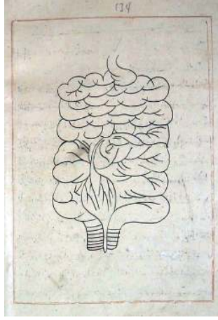
Figure 6: The illustration at the end of the fifth section of the second chapter [The fifth section.

also is from the same quality, so the wisdom of God, may He be exalted (الله تَعَالَى / Allāh ta‘ālā), is that one of them should be similar to the nature of water and the other should be similar to the nature of fire” 86 .