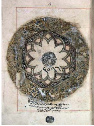
Figure 1: The first page of Tānksūqnāme-i Īlkhān Der Funūn-i Ulūm-i Khaṭā'ī in Ayasofya Collection, Nr. 3596, in Süleymaniye Manuscript Library, İstanbul, Türkiye (Courtesy of Türkiye Yazma Eserler Kurumu Başkanlığı, İstanbul, Türkiye).

The first book of Tānksūqnāme-i Īlkhān Der Funūn-i Ulūm-i Khaṭā'ī consists of 12 chapters, which are divided into sections and subdivisions 29 .