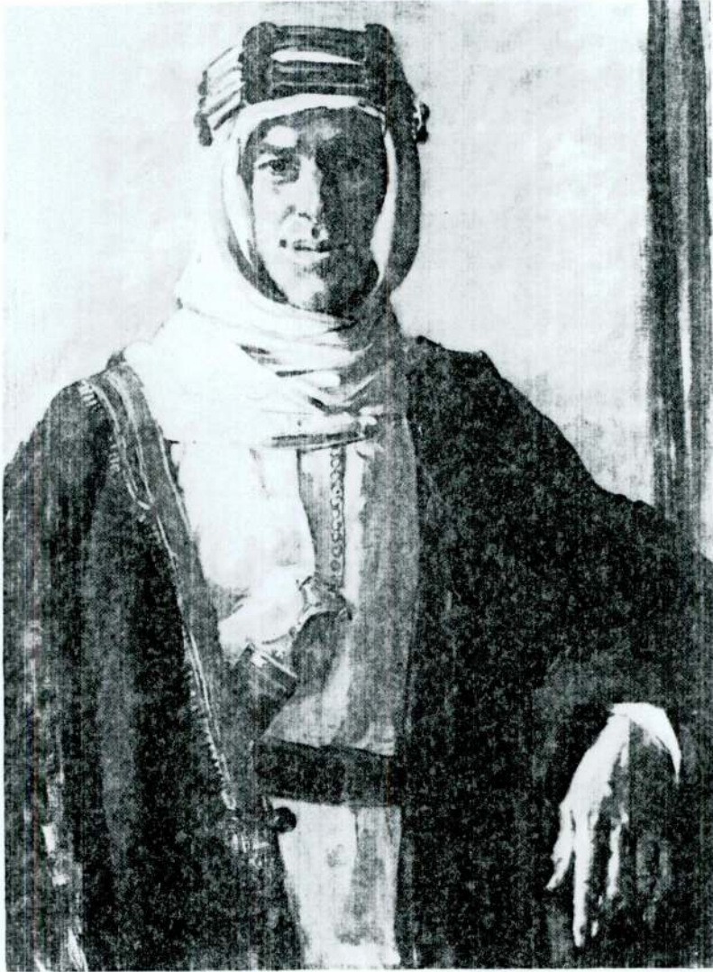
Belge No. 1